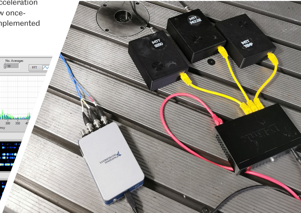
Acceleration data being used to detect unwanted events.